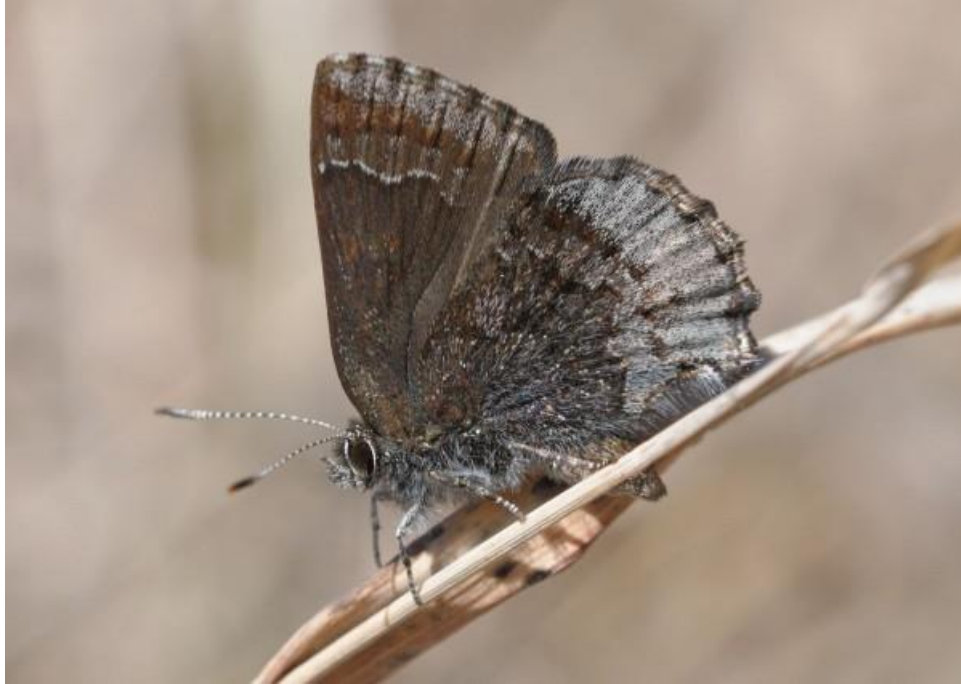
The Hoary Elfin gets its common name from the whitish scales along the margins of the ventral fore and hindwings. Mars Sand Hills, 5 May 2011.