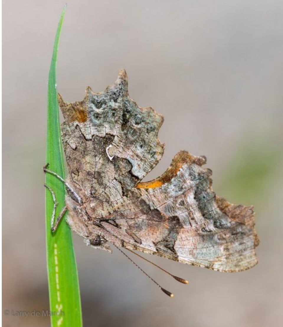
The shape and general pattern of this Green Comma are typical of the group – Whiteshell Provincial Park, 15 July 2007.

The common Compton Tortoiseshell is a widely distributed northern species whose range covers not only a large part of Canada and the northeast United States but an area from Eastern Europe to the Asian Pacific coast. It is another mainly orange butterfly, resembling an oversized comma, complete with a small white punctuation mark on the ventral side of the hindwing. It overwinters as an adult and flies primarily in forests, including riparian forests, where the caterpillars feed on alder, willow, poplar ( Populus ) and birch. The less common Milbert's Tortoiseshell is easily identifiable with a large brown triangular basal area on its wings bordered by a broad band that shades from yellow to bright orange. This band gave rise to the seldom-used but more expressive name, Fire-rim Tortoiseshell. Another nettle feeder, this species overwinters as a pupa or adult.