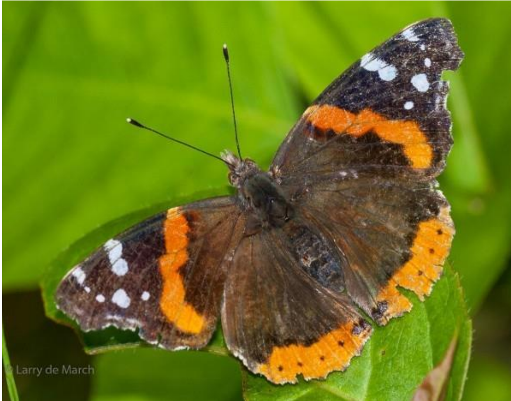
Red Admiral at Whiteshell Provincial Park, 5 July 2007.

With large eyespots on the dorsal wing surfaces, the spectacular and unmistakable Common Buckeye is an occasional vagrant that can show up in almost any open-area location from early June to early October. Sightings have been made in scattered locations across the study area including Buffalo Point, Winnipeg, Oak Hammock Marsh, Hecla Island, and near Pinawa. It has bred in Manitoba at least once.