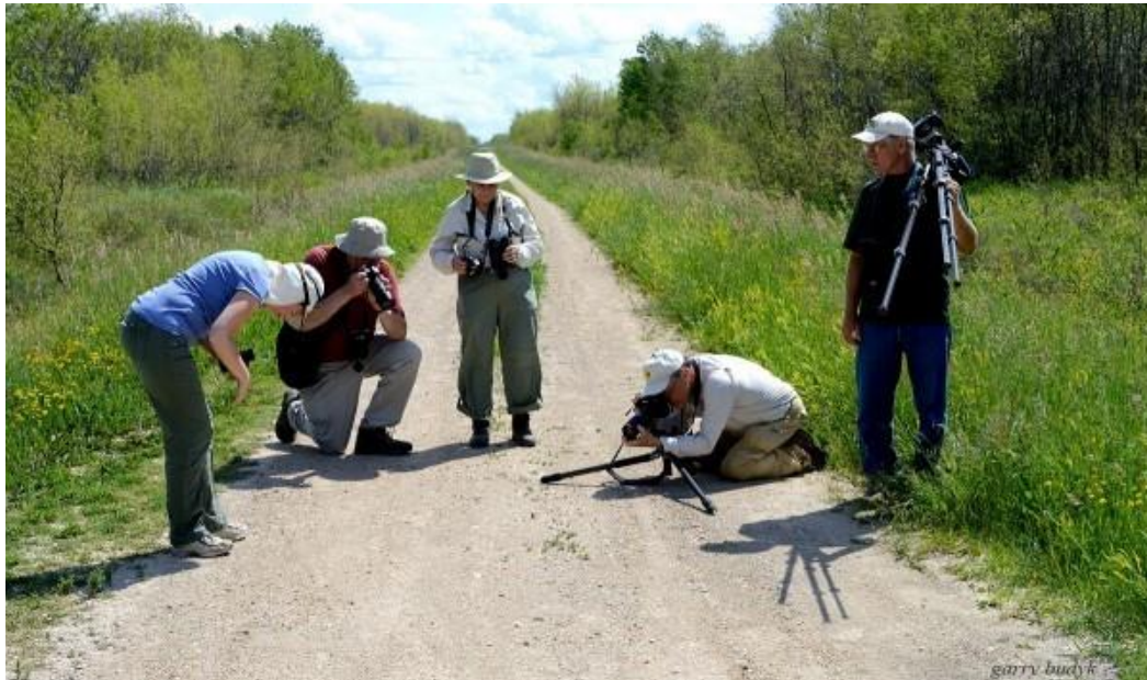
Butterfly enthusiasts concentrate on a basking Northern Blue on a trail near Chatfield, 29 June 2016.

Five full field seasons have now passed in a five-year project to record butterfly species and numbers in southeast Manitoba. It started with records reported to the Yahoo discussion group Manitobanaturetalk, but later included sightings from group field trips and from individuals who contributed sightings directly to the authors.