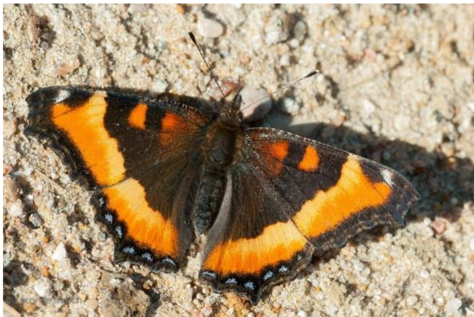
Milbert's Tortoiseshell is arguably one of the most beautiful butterflies found in Manitoba. Sandilands, 11 October 2011.