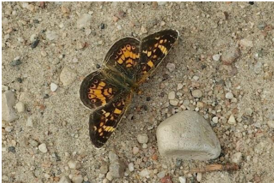
Male Tawny Crescent drinking from wet sand near St. Labre, 4 July 2014.