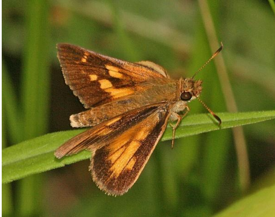
Broad-winged Skipper, a Manitoba rarity, near Pinawa, 3 August 2008. It is in the “jet-plane” posture, highlighting the left forewing and right hindwing.

As well as small size and flighty behaviour, many skippers have plain coloration, with various combinations of tawny-orange to blackish brown markings, sometimes with a few clear or whitish spots. This makes identification of photographs or specimens, let alone live insects, a challenge.