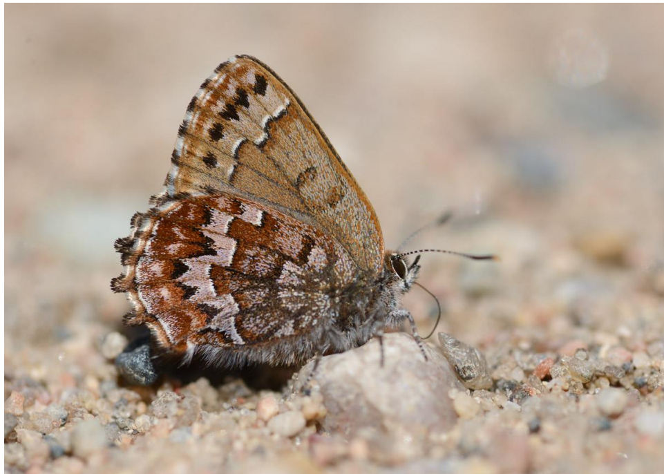
The Eastern Pine Elfin and its Western counterpart are the most distinctively marked elfins. This Eastern individual was imbibing moisture in Agassiz Provincial Forest, 27 May 2019.