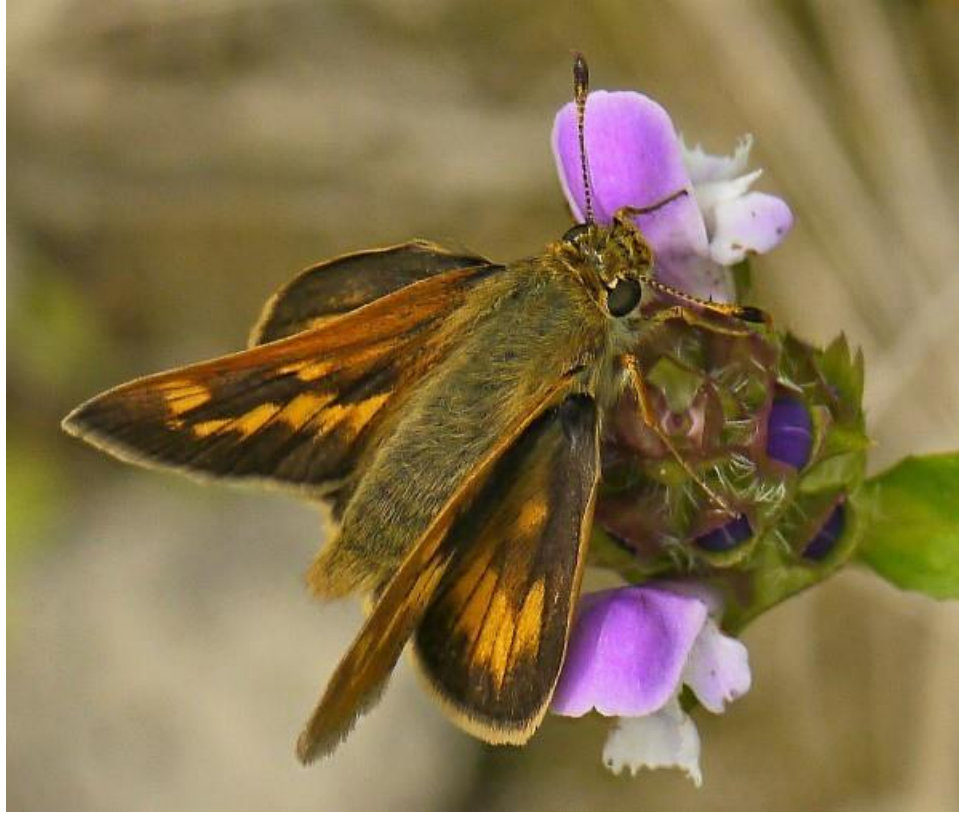
Another jet plane! A Long Dash Skipper visits a Self-Heal flower head near Culver, 3 July 2019.