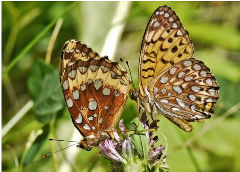
Sometimes the butterflies themselves get confused! Here, a male Atlantis Fritillary (right) appears to be courting a Great Spangled Fritillary, whose raised abdomen is an expression of disinterest (near Pinawa, 17 July 2018). Note the different eye colours, and the broader pale band on the Great Spangled hindwing.