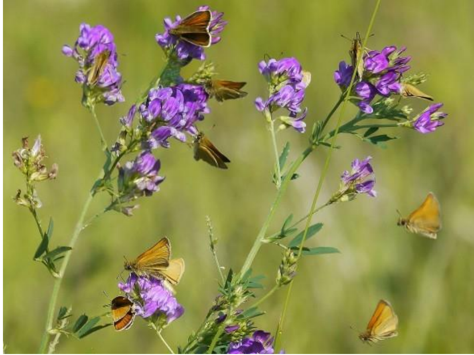
A dozen European Skippers, part of a swarm nectaring on a roadside alfalfa patch near Hadashville, 11 July 2013.