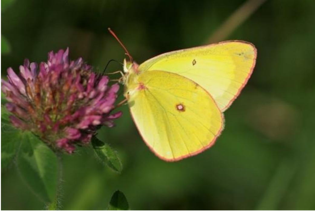
Pink-edged Sulphur male on Red Clover - St. Labre, 5 July 2014.

The Pink-edged Sulphur is found in boreal regions and over the Canadian Shield, where its caterpillars feed on various species of blueberries ( Vaccinium , section Cyanococcus ), and not legumes as do the previous two species. It is poorly named because other species also may have pink edges to their wings, especially when freshly emerged from their chrysalids. This species flies mostly in the month of July. Two additional species, the Giant Sulphur and the Christina Sulphur, have been recorded in locations near the boundaries of our area in southeast Manitoba, but none was reported during our survey. Two southern species, the Mexican Sulphur and the Dainty Sulphur, have also been recorded in the past as rare vagrants. When seeking the latter species, beware of undersized individuals of the Clouded Sulphur!