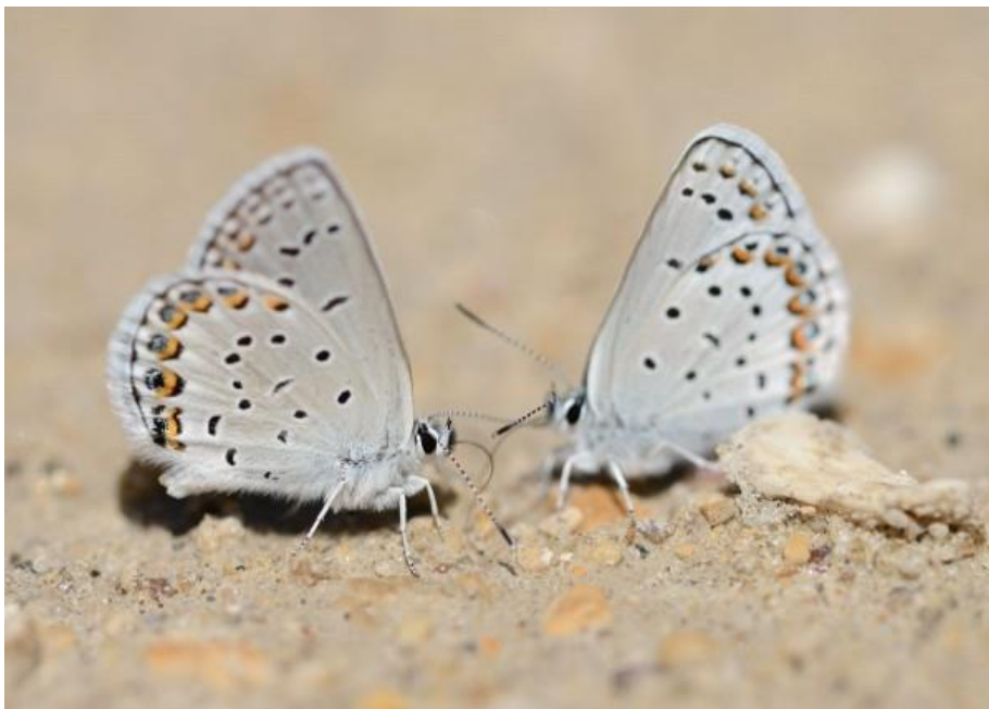
Two Northern Blues north of Lee Lake Provincial Wildlife Management Area, 27 June 2018.