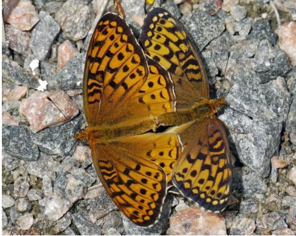
Mating pair of Atlantis Fritillaries south of Bloodvein, 6 July 2016 (male on left). If disturbed, a male butterfly carries the female in a short flight for cover.