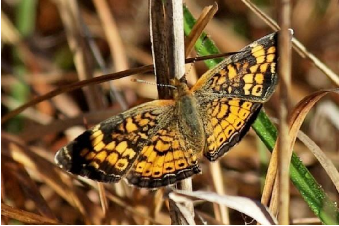
Male Pearl Crescent warming in the sun at Winnipeg, 27 June 2012.

Whereas males of all three species have wings that are primarily orange and marked by black lines and patches, they can be distinguished from each other by the degree of black markings. These markings are most extensive in the Tawny Crescent. The Northern Crescent has an open area of unmarked orange in the centre of each hindwing, which is lacking from the hindwings of the more southern and provincially uncommon Pearl Crescent. The females of these species are so similar to each other that their identification is best left to occasions when they are associated with the more identifiable males! Except for the Tawny Crescent, our species have two overlapping generations per year peaking in June and August, with some individuals flying as late as mid-September.