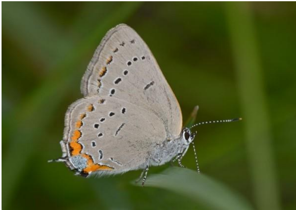
Acadian Hairstreak resting in vegetation near Lauder Sand Hills, 17 July 2013.