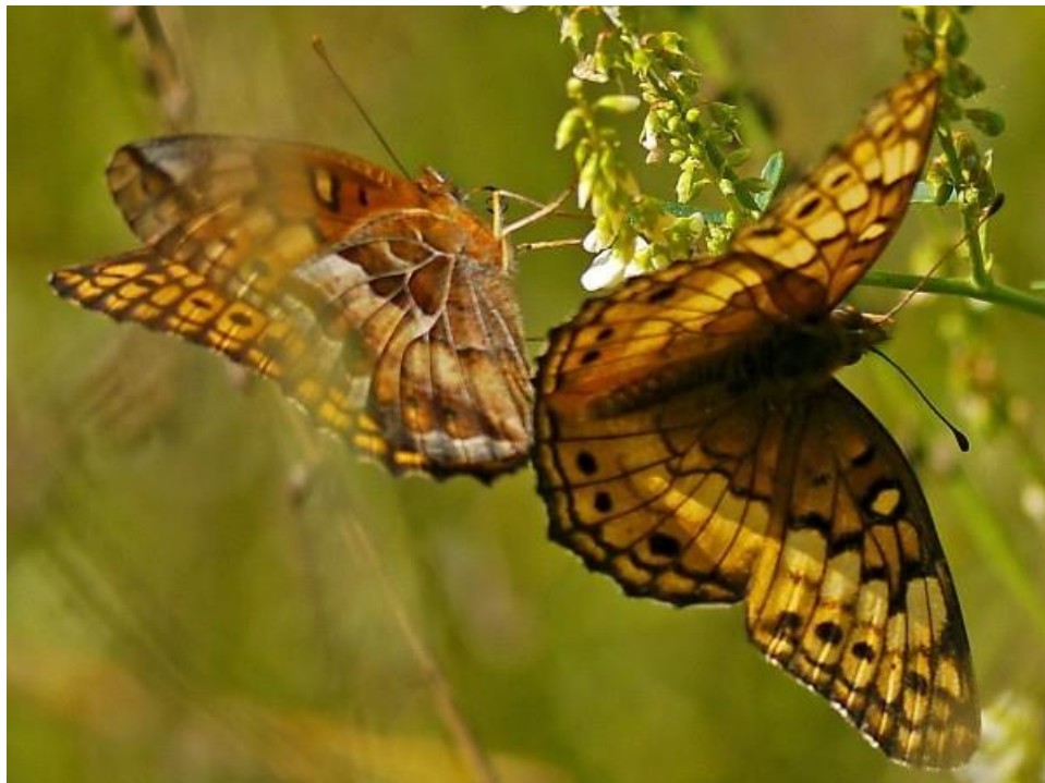
Two Variegated Fritillaries jostle for nectar from White Sweet-Clover flowers on a windy day at Brightstone, 10 September 2016.

front pair of legs, which often have brush-like hairs and are curled up in front of the eyes; they have a sensory rather than walking function. Thus, these butterflies are in effect quadrupeds, though anatomically hexapods like all insects. Manitoba fritillaries are grouped mainly as greater (genus Speyeria ) and lesser ( Boloria ), while one member of the Neotropical genus Euptoieta , the Variegated Fritillary, is an uncommon migrant that may turn up any time from late spring to early fall. The sole record of the closely related Mexican Fritillary was an extraordinary find at Sandy Hook in 1980.