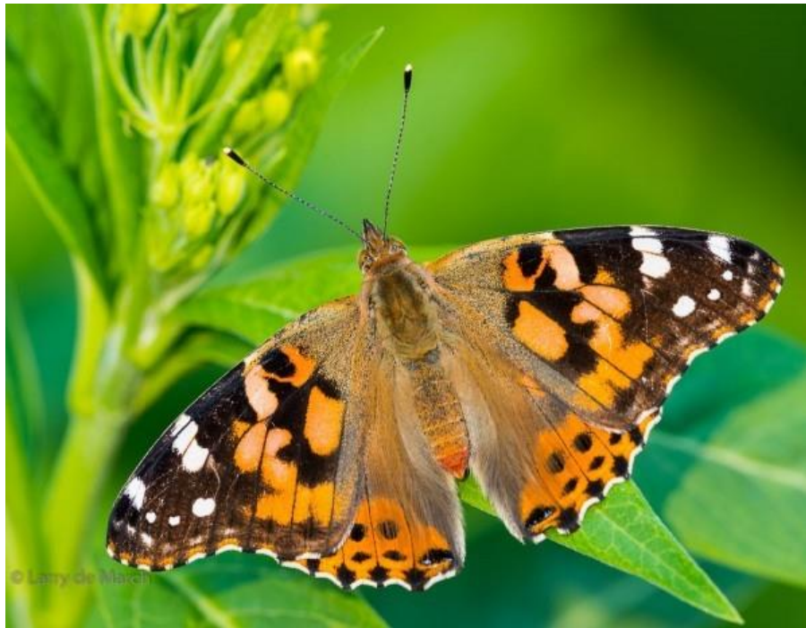
This Painted Lady was one of many delightful visitors to the English Gardens at Assiniboine Park, Winnipeg on 13 September 2017.

The Painted Lady has a global distribution. Its high-altitude fall migration from northern Europe to Africa is the longest migration of any butterfly species. Painted Ladies cannot overwinter in Manitoba. Migrants arrive from May on and there are two generations per year. Concentrations during the autumn migration can be large and the remarkable numbers in many parts of North America including southern Manitoba in September, 2017 were enjoyed by anyone who saw them. Large numbers were also seen in 2019, though not as many as in 2017. Painted Lady caterpillars feed on a wide variety of plants including sunflowers and thistles. Adults can be found almost anywhere in open areas and they nectar on many species of wild and domestic flowers.