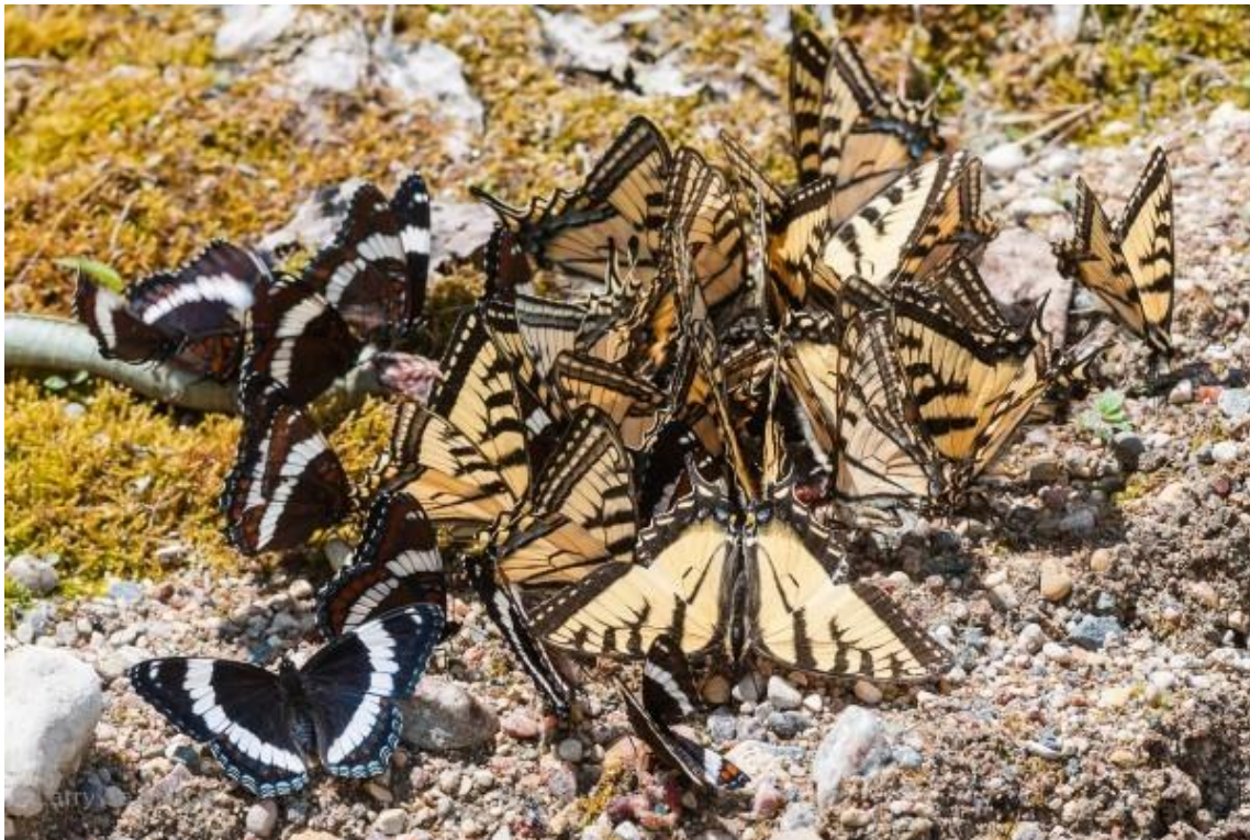
These White Admirals and Canadian Tiger Swallowtails are “puddling”, i.e., drinking, in this case from wet sand in the Sandilands area, 15 June 2012. Puddling also occurs on dung and carrion. Butterflies obtain minerals and amino acids from this activity.

As well as furnishing a lot of data and photographs, our field trips have left us with many indelible memories, especially from the period of peak butterfly diversity around the beginning of July. A combination of sunshine after recent rain with abundant roadside flowers can yield some fine spectacles of assorted puddling and nectaring butterflies along little-used rights-of-way. Provincial roads west of Chatfield (PR 419) and south of East Braintree (PR 308), and gravel roads in and near Agassiz Provincial Forest, were especially rewarding.