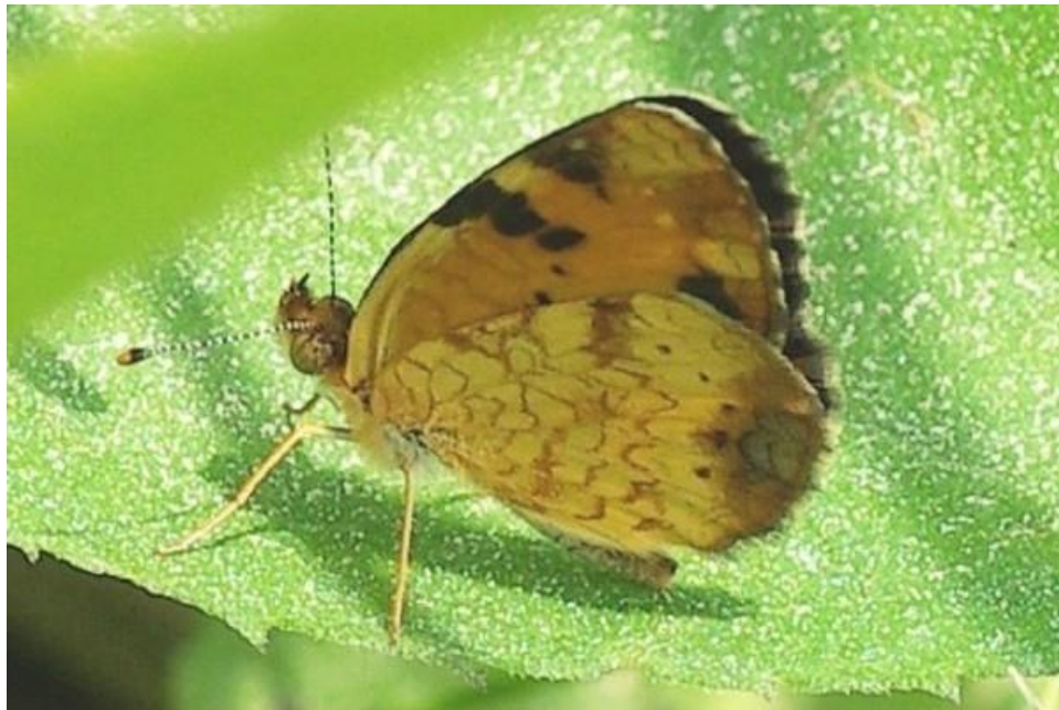
Northern Crescent near East Braintree, 11 July 2015, showing the silver crescent on the underside of the hindwing.