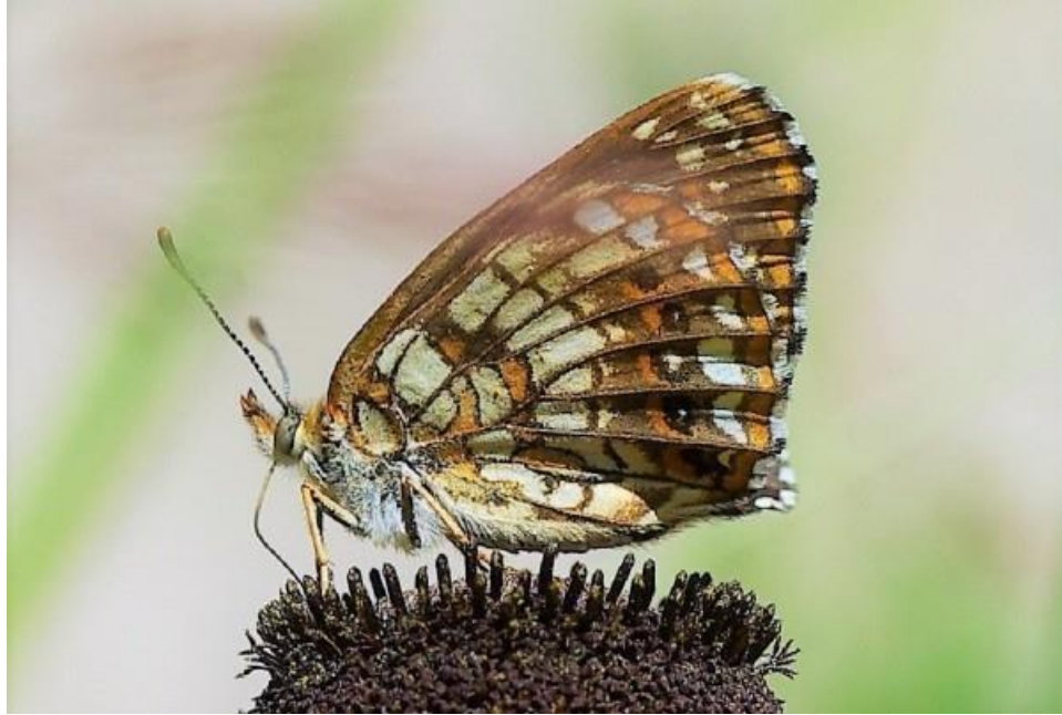
Harris's Checkerspot on Black-eyed Susan, showing checkered pattern underneath; near Julius, 15 July 2017.