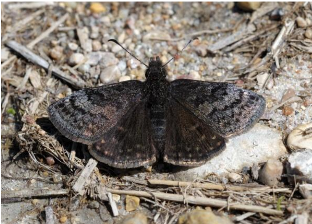
Dreamy Duskywing at Birds Hill Provincial Park, 20 May 2010.

With greyish-blue bands across the forewings and no forewing spots, the Sleepy and Dreamy duskywings are nearly identical in appearance but differ in their choices of host plants - Sleepy Duskywing larvae feed on oak, while willows and poplars are host plants for Dreamy Duskywing. Both of these species are more likely to be seen basking or puddling on a forest road than while nectaring, sometimes in close proximity.