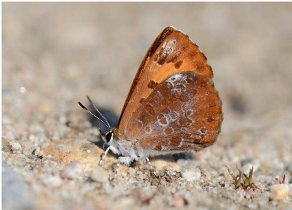
Harvesters are most often seen while puddling. Brightstone Provincial Forest, 18 May 2016.

The uniquely patterned Harvester is found near forested streams or rivers, often near alders. Its larvae feed on insects (especially Woolly Alder Aphids, Prociphilus tessellatus ), making this our only carnivorous butterfly caterpillar. In Manitoba, the spring flight is more robust than the summer one, and adults are most often seen in late May to mid-June.