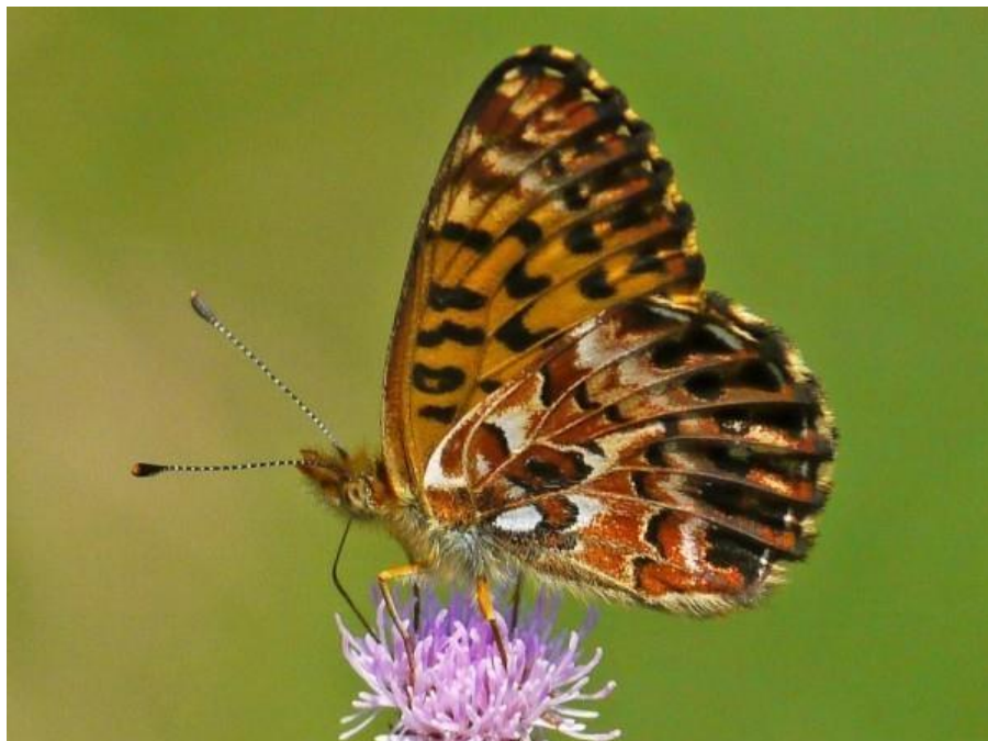
The “brush-footed” forelegs are prominent in front of the eyes of this Arctic Fritillary near Milner Ridge, 25 July 2015.

The eleven fritillary species found regularly in our area form a distinctive group within the family Nymphalidae, the brush-footed butterflies. This is the most diverse butterfly family, with over 6000 species worldwide. One of the main family characteristics is the reduced size of the