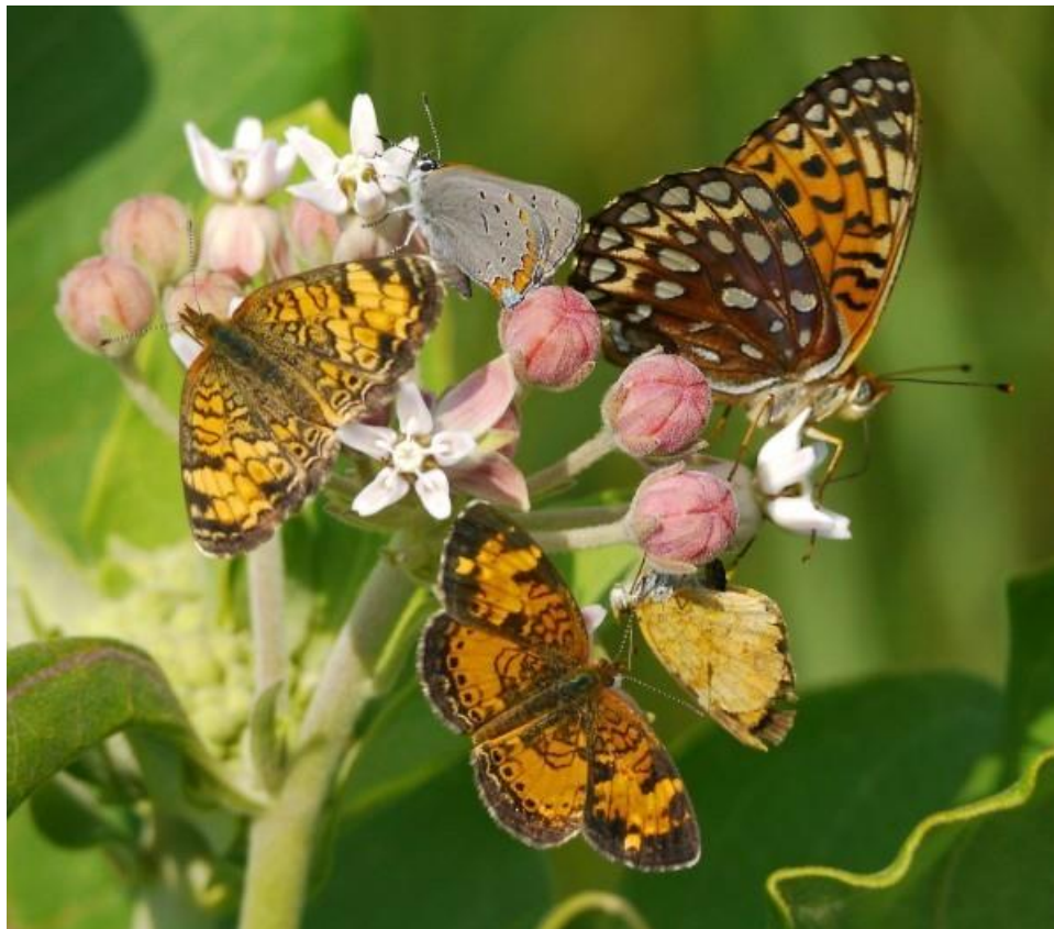
Common milkweed is well known as a larval food plant for Monarchs, but is also a nectar source for many other butterflies, like this group west of Milner Ridge on 16 July 2019. Clockwise from upper right: Atlantis Fritillary; two male Northern Crescents (wings closed and open); unidentified crescent (probably an aberrant female Northern); Acadian Hairstreak.

In 2014, we kept a casual list of “first-date-of-the-year” records for any butterfly species that were reported. By the end of the year, we had records for 83 species. The enthusiasm of Manitoban naturalists encouraged us to record all butterfly sightings the following year and then to continue recording for a further four years.