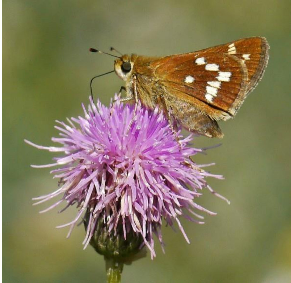
Leonard's Skipper, a special find at a thistle patch near the Wanipigow River, 17 August 2016.