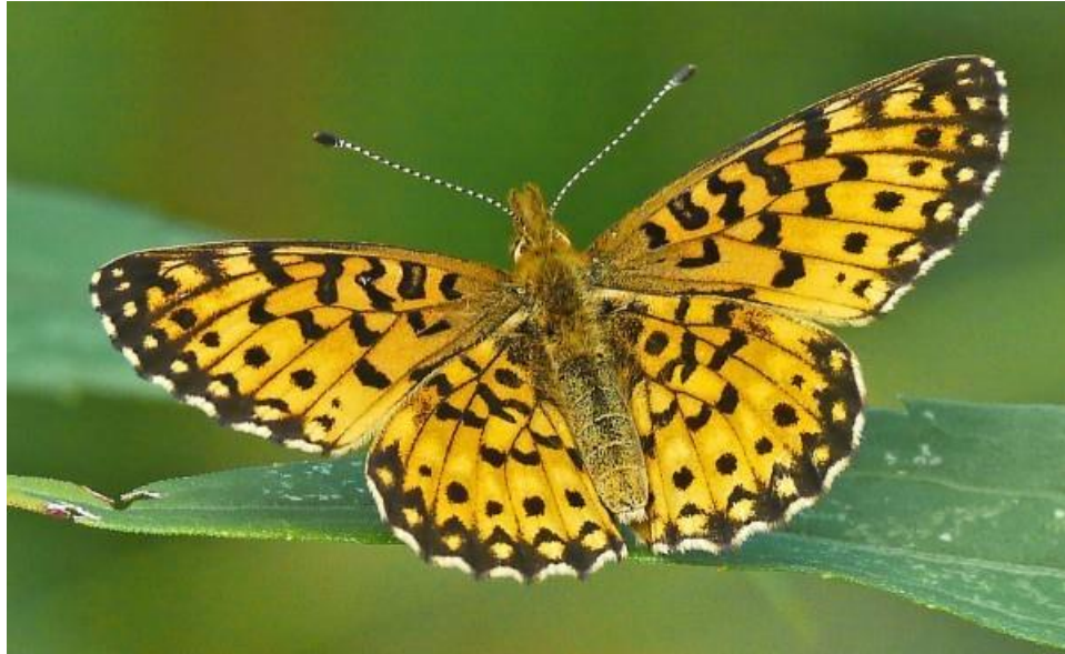
Silver-bordered Fritillaries rarely pause for long in the open like this one near Milner Ridge, 12 August 2017.