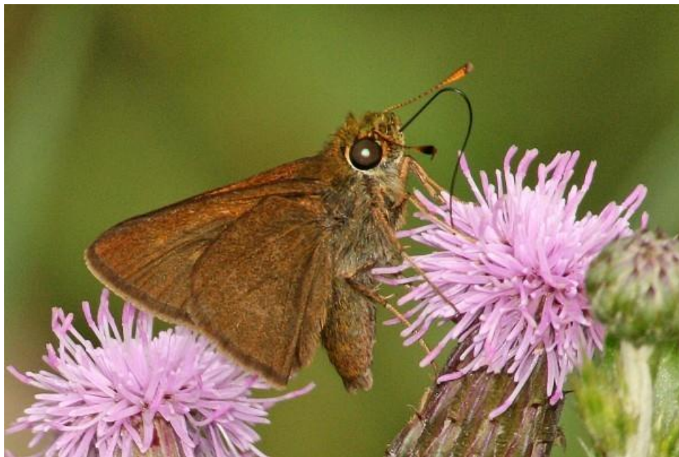
A male Dun Skipper feasts on Canada Thistle nectar near East Braintree, 30 July 2008.