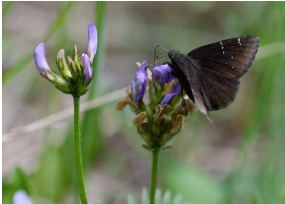
A Northern Cloudywing nectaring along a forest road near Pine Falls, 5 June 2017.