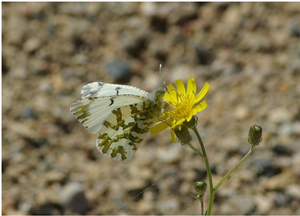
Large Marble nectaring on Hawksbeard near Mafeking, 24 June 2014.