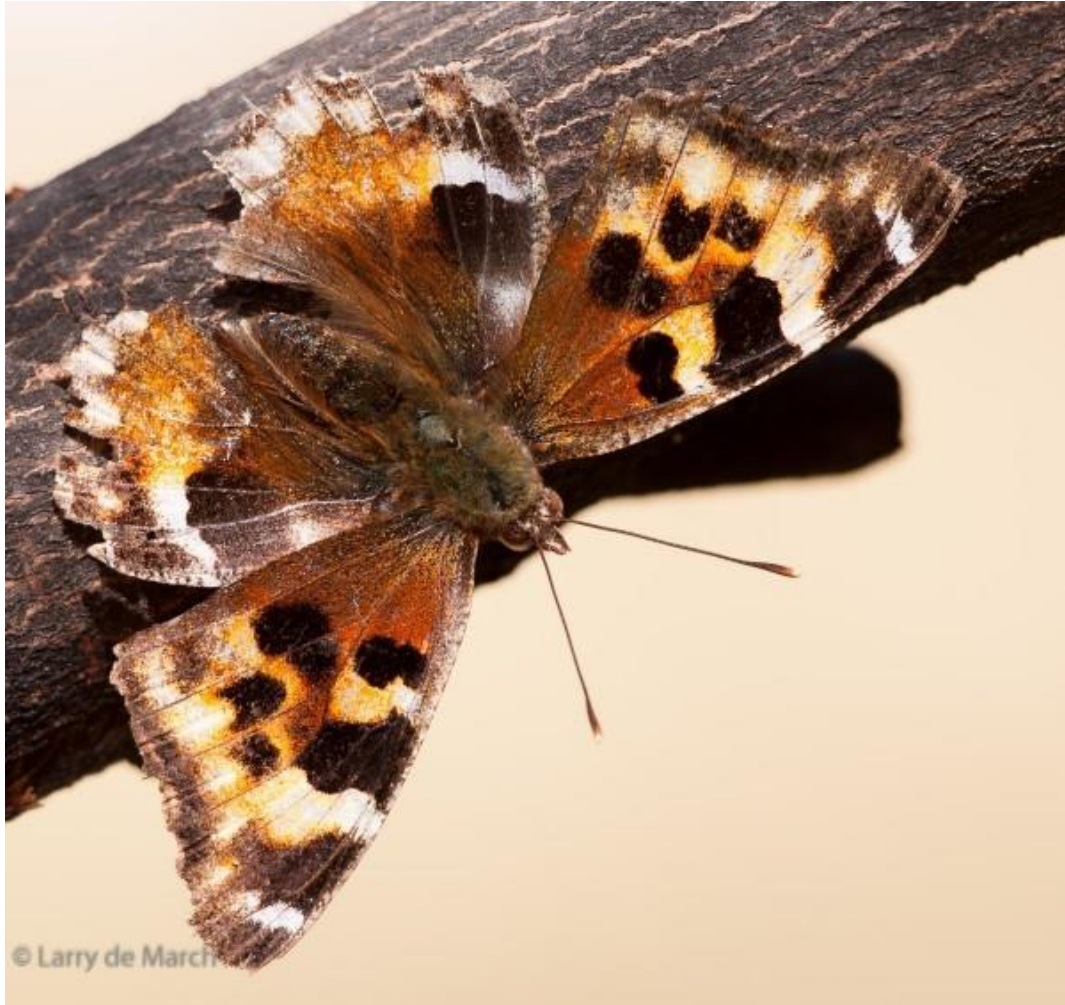
Butterflies that overwinter as adults can become extremely worn like this Compton Tortoiseshell feeding on tree sap at Winnipeg, 16 April 2010.

The Mourning Cloak is another species we share with Eurasia. Its British name, Camberwell Beauty is far more uplifting than the Mourning Cloak name used by North Americans and speakers of other Germanic languages. A common species, its adults can be seen early in the spring when they come out of hibernation, through July when a new generation emerges, to late in the fall before they find a place to spend the winter. They are easily identified by their maroon/brown wings bordered with blue spots and a yellow band, which can fade to white with age. It is a ubiquitous species that feeds on willow, Eastern Cottonwood ( Populus deltoides ), elm and birch leaves.