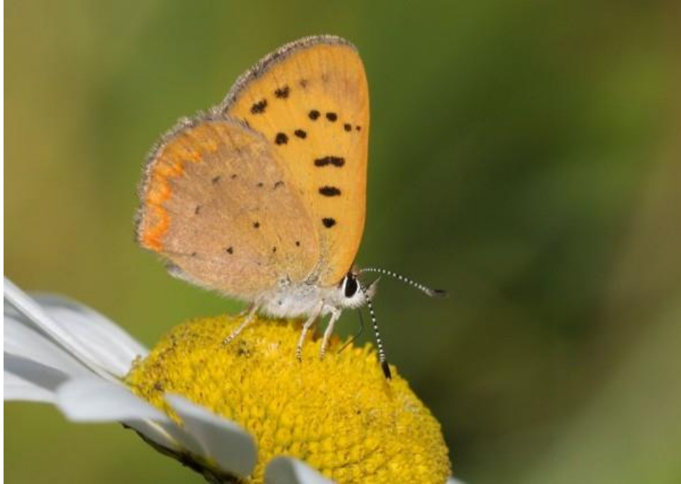
The dorsal wing pattern is the best way to differentiate the Dorcas and Purplish Coppers, which otherwise look nearly identical; the habitat where the butterfly was seen and host plant presence will also provide clues as to the butterfly's identity. This Dorcas Copper was seen in Whiteshell Provincial Forest, 2 August 2009.