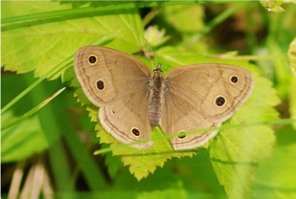
Little Wood Satyr. Living Prairie Museum, Winnipeg. 18th June 2016.