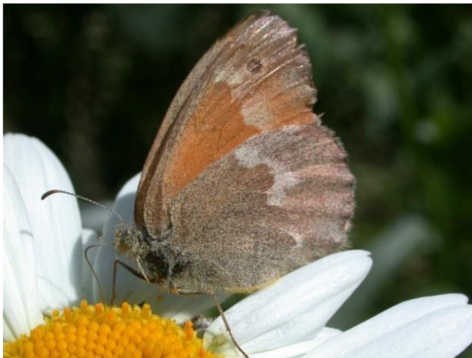
Common Ringlet nectaring on Oxeye Daisy at Winnipeg, 19 June 2007.

The Common Ringlet and the Little Wood Satyr are both on the wing during June and July but are found in different habitats. The ringlet (known as the Large Heath in England) occurs in pastures and other grassy places where it flutters for short distances before dropping back into the grass. On the other hand, the wood satyr is usually seen jauntily flying through the branches and tangles of shrubbery in woodland edges that defy anyone from following.