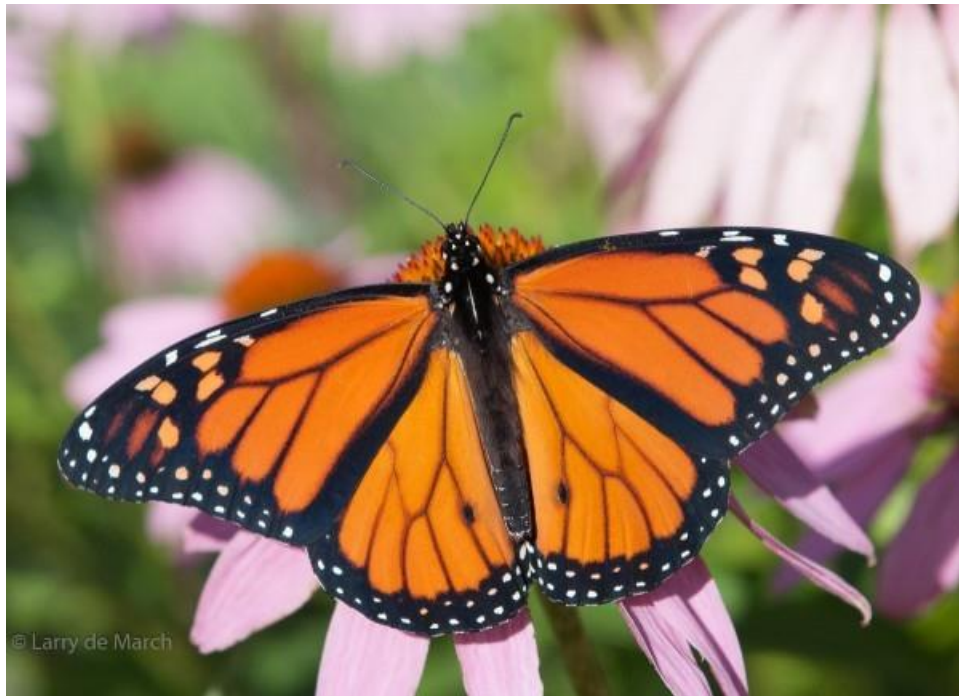
This Monarch, photographed in Winnipeg, 10 September 2009, will have migrated to Mexico.