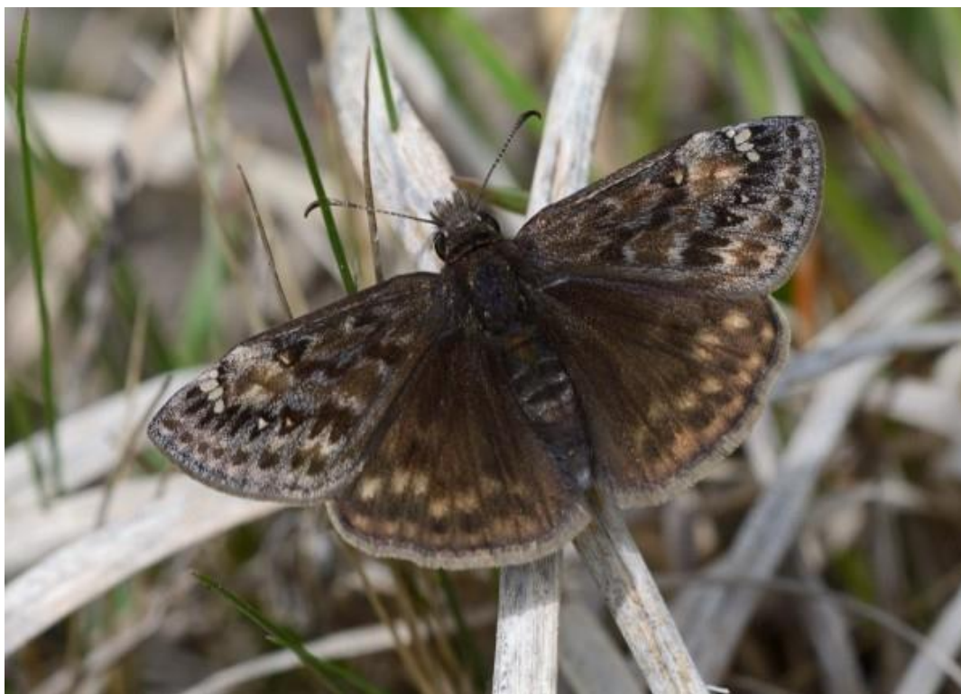
Juvenal's Duskywing male at Sandilands Provincial Forest, 2 June 2016. Females have larger forewing spots than males.

The final two species in this section belong to the genus Pyrgus . The diminutive Northern Grizzled Skipper is grey with variably-sized white patches on the wing surfaces and heavily checkered fringes. It is a rare treat to see one basking on a granite outcrop or nectaring at early spring flowers. The larvae are reported to feed on cloudberry and perhaps wild strawberry. Our latest-flying spreadwing, the Common Checkered Skipper, prefers open areas and can be seen any time between spring and fall. The male is a striking bluish grey with a myriad of white spots and squares; the female is darker overall. The wing fringes are lightly checkered. Unlike the former species, the Common Checkered Skipper has two or three generations per year; even so, not many individuals were found during our survey. Various mallows (Malvaceae) provide larval nourishment.