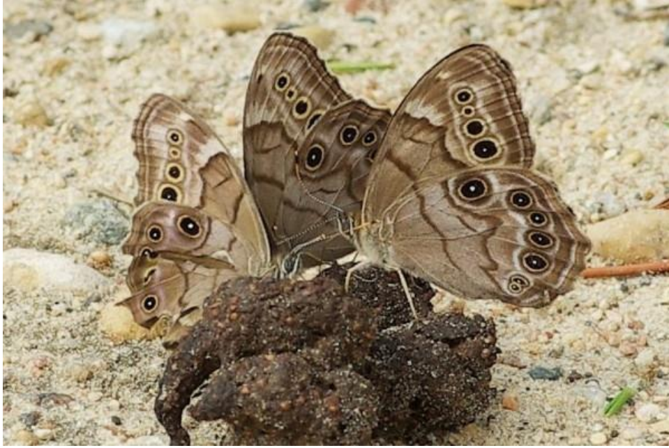
Northern Pearly-eyes feeding on animal scat near St. Labre, 4 July 2014.