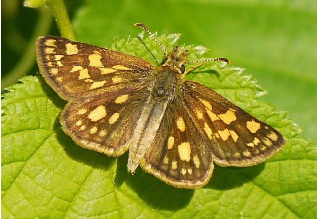
Arctic Skipper in spread-winged posture near Pinawa, 10 June 2019.

This species accounted for just over half of our grass-skipper records, making it a special challenge to detect the similar-looking Least Skipperling, which is usually found in waterside or emergent vegetation. We found the Dun Skipper to be the most numerous native species, and it was also the least variable in numbers from year to year. This uniformly dark skipper is an avid nectar feeder and a relatively late flier, peaking in mid to late July.