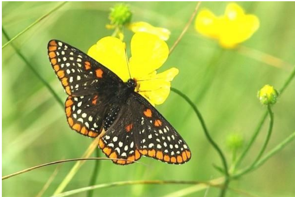
Baltimore Checkerspot on a buttercup near East Braintree, 11 July 2015.

Between 2015 and 2019, we found seven species of checkerspots and crescents in southeast Manitoba. With the exception of the striking Baltimore Checkerspot, the species look superficially quite similar to each other with their orange wings criss-crossed with black lines and patches. Their lower wing surfaces, however, are more distinct; the arrangement, numbers and shapes of silvery-white markings are clues to differentiating the species. As their name suggests, most checkerspots have a checkerboard pattern of markings on the lower surfaces of the hindwings, whereas the crescents have a single moon-shaped silver crescent near the wing edge. Checkerspots and crescents are attracted to nectar-rich flowers, but also have an affinity to animal dung and the carcasses of mammals.