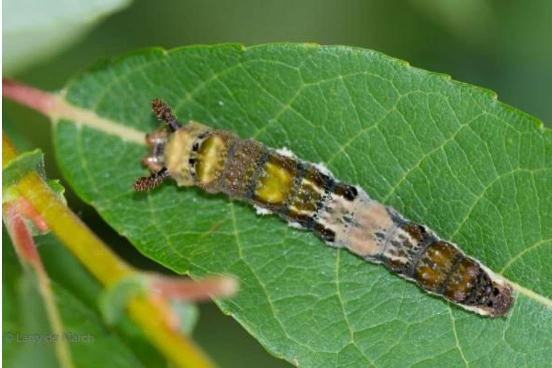
This White Admiral caterpillar is easily mistaken for a bird dropping. Whiteshell Provincial Park, 3 August 2013.

The Viceroy is well known in biological circles as a Batesian mimic of the Monarch butterfly. A Batesian mimic has a similar colour and pattern as a species that is either toxic or unpalatable to predators. The smaller Viceroy can be told from the Monarch most easily by the thin dark line cutting across the hindwings. Just to confuse observers, this line is sometimes missing and other differences in the wing pattern have to be used for identification. Viceroy's are typically found near water or other moist area where two generations of caterpillars, camouflaged as bird droppings, feed on leaves of willows and poplar.