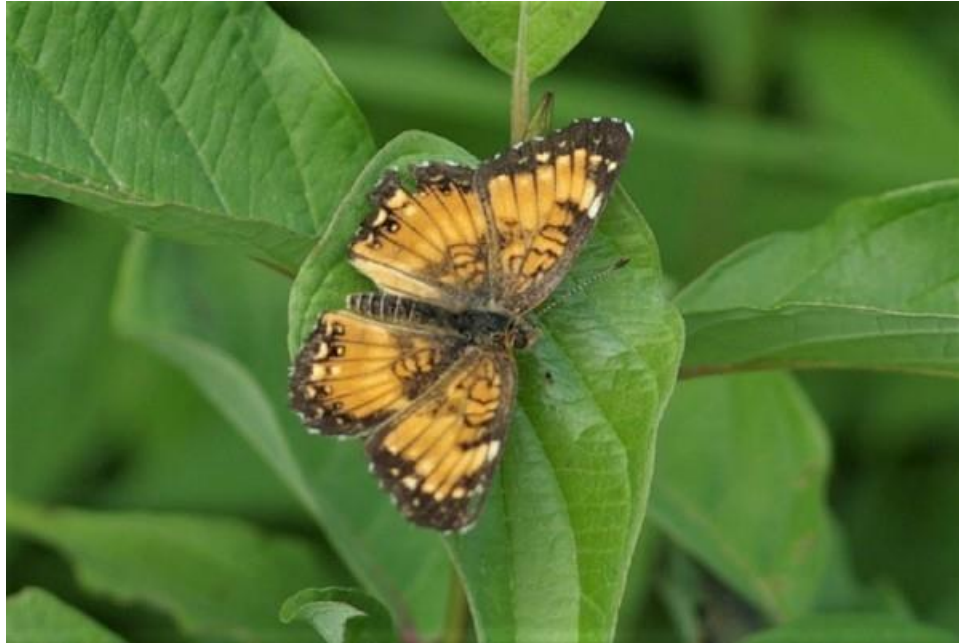
Harris's Checkerspot basking in the sun near Julius, 15 July 2015.

Caterpillars of both checkerspots and crescents have rows of branched spines along their bodies and may live in colonial webs for protection when they are young. Caterpillars of crescents feed on the foliage of various species of asters ( Aster ) whereas those of checkerspots also feed on sunflowers ( Helianthus ) and Black-eyed Susan ( Rudbeckia hirta ). The scarcity of the Baltimore Checkerspot in Manitoba may in part be related to the scarcity of the food plant of its caterpillar, the White Turtlehead ( Chelone glabra ), which itself is restricted to damp woodland edges.