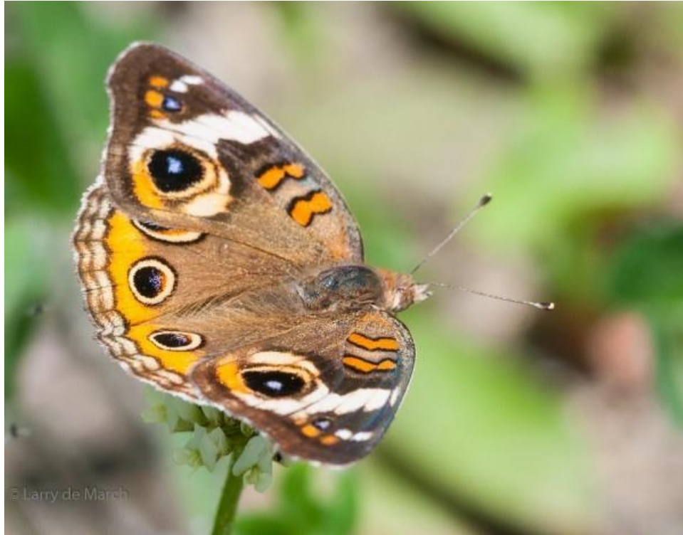
A Common Buckeye found in Sandilands Provincial Forest, 15 June 2012.