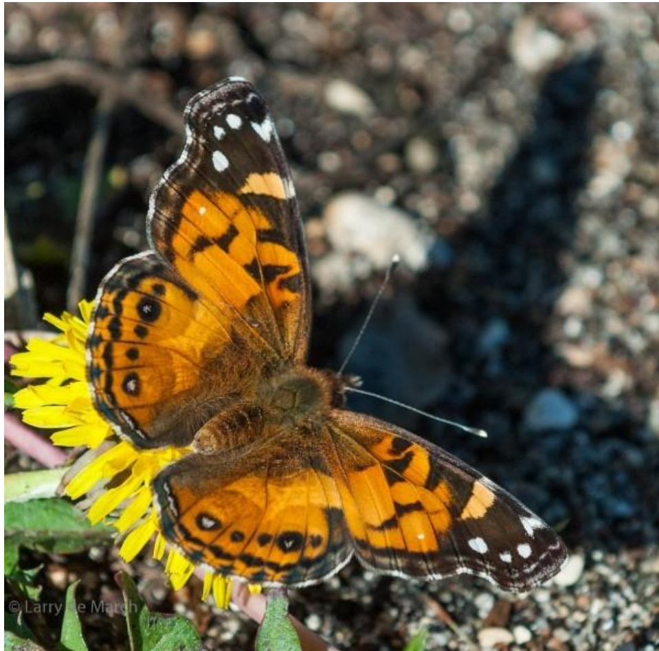
This American Lady was a nice bonus on a birding trip near St. Ambrose, 22 September 2007.

The uncommon American Lady differs from the similarly patterned Painted Lady by having two large eye spots on the underside of the hindwings and a tiny but obvious white spot in the middle of an orange cell on the dorsal forewing. Like the Painted Lady, it likely cannot overwinter in Manitoba and migrants can be seen from early May on with two generations produced in summer. Caterpillars feed on a number of plants in the Asteraceae including pussytoes ( Antennaria ), pearly everlasting ( Anaphalis margaritacea ), and burdock ( Arctium ). The adults, which can be found in many open habitats, are fast flyers that often cooperate with the viewer by nectaring with their wings spread for easy identification.