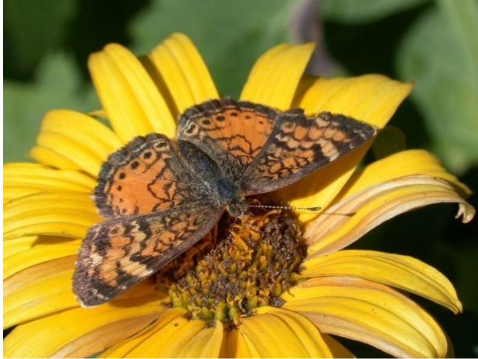
Male Northern Crescent nectar-feeding on a sunflower at Winnipeg, 26 June 2011.