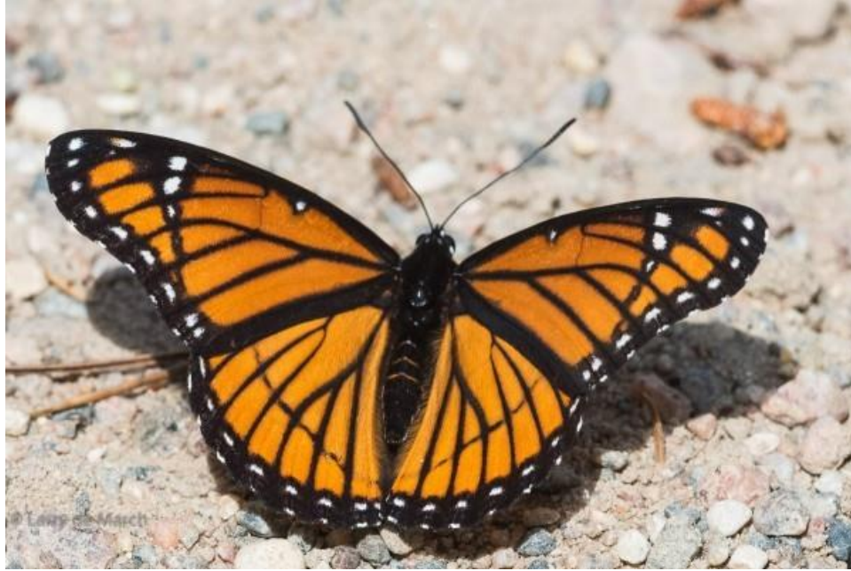
Viceroy, Agassiz Provincial Forest, 2 July 2017.