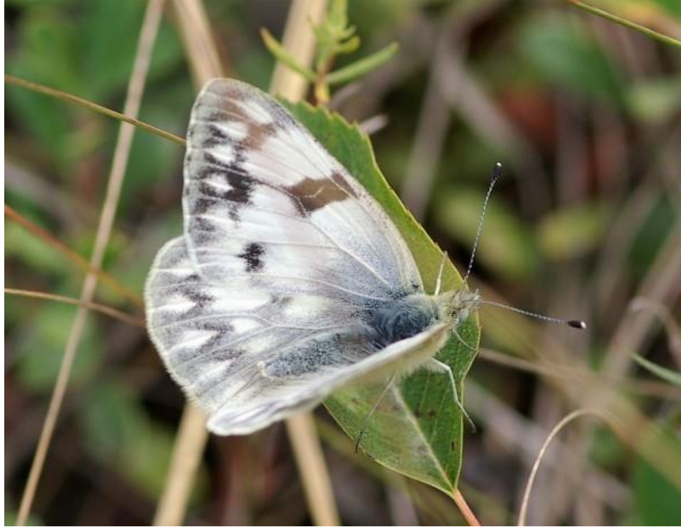
Western White female at Interlake Forest Centre, Hodgson, 31 August 2011.