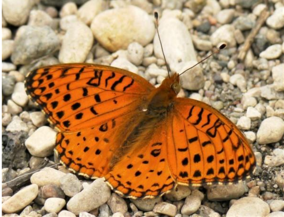
This finely marked male Aphrodite Fritillary near Inwood, 24 July 2018, is easier to identify than boldly marked females, which may closely resemble Atlantis Fritillaries.

The three common greater fritillaries have a single summer flight, peaking in July, with Aphrodite Fritillary averaging slightly later than Great Spangled and Atlantis. Though they are quite common annually, 2018 was a bumper year for all three species. These widespread butterflies are often found in close proximity to each other when visiting thistles ( Asteraceae: Cardueae ), milkweed ( Asclepias ), or other abundant nectar sources, usually in or near forest settings. Aphrodite Fritillaries, however, tend to favour dry (rocky or sandy) upland habitats, while Atlantis Fritillaries prefer lower-lying, boggy areas. The Northwestern Fritillary, only found twice in our five-year survey, reaches its eastern range limit in southeast Manitoba. Three prairie species, the Regal, Callippe, and Edwards' Fritillaries, formerly occurred at least sparingly in our area but have not to our knowledge been recorded here for many years.