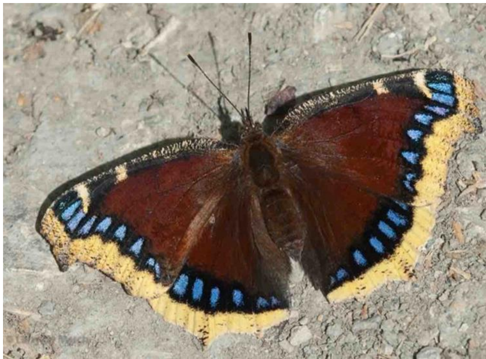
Upper left: This Mourning Cloak caterpillar is typical of the caterpillars of commas and related species. Whiteshell Provincial Park, 29 June 2007. Upper right: The chrysalis of Mourning Cloak is similar to those of other species in this group. Whiteshell Provincial Park, 5 July 2007. Lower: The Mourning Cloak is one of our easiest to identify butterflies. Winnipeg, 9 July 2007.