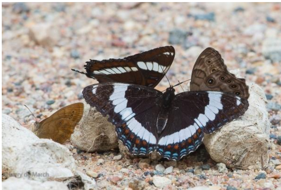
These White Admirals were sharing a Gray Wolf scat meal with an Eyed Brown (left) and a Northern Pearly-eye (right) in Sandilands Provincial Forest, 2 July 2014.