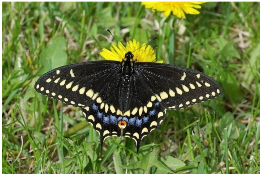
Black Swallowtail male on Dandelion - Ste Geneviève, 16 May 2012.

Our three kinds of swallowtails are part of a mostly tropical family of very showy butterflies (Papilionidae) and include the largest butterfly in the world, the Queen Alexandra's Birdwing butterfly of Papua New Guinea. The Old World Swallowtail just reaches southward into the northern edge of our area, where we have only three records. It is generally uncommon anywhere in our province.