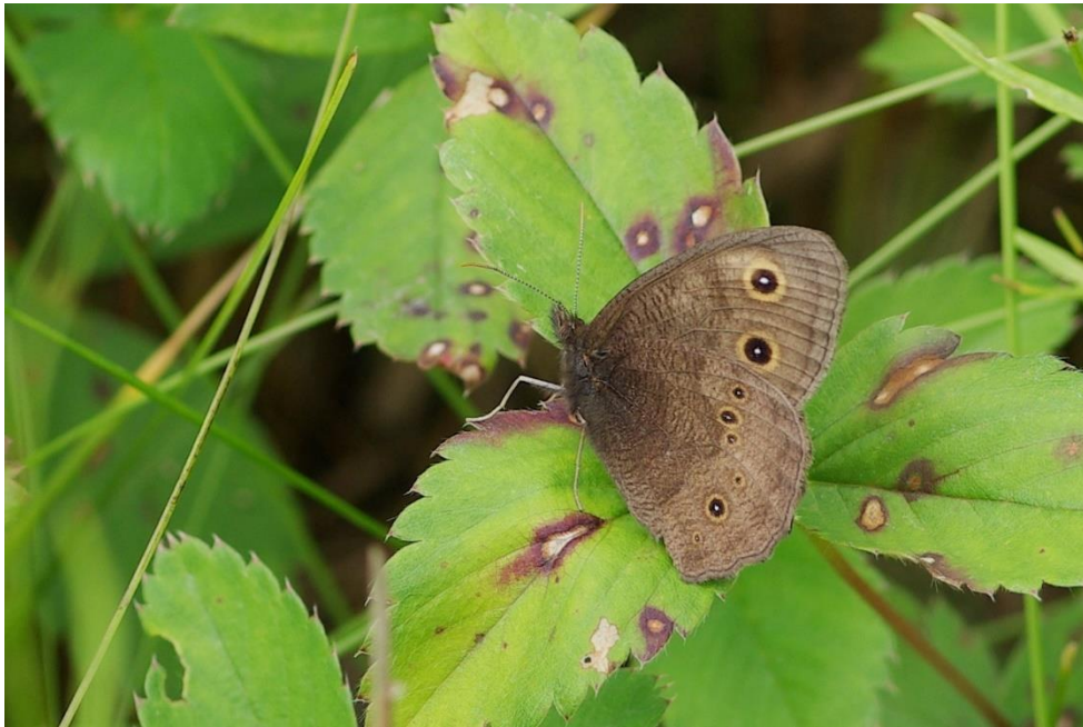
Common Wood Nymph, Moose Lake Provincial Park, 25th July 2014.