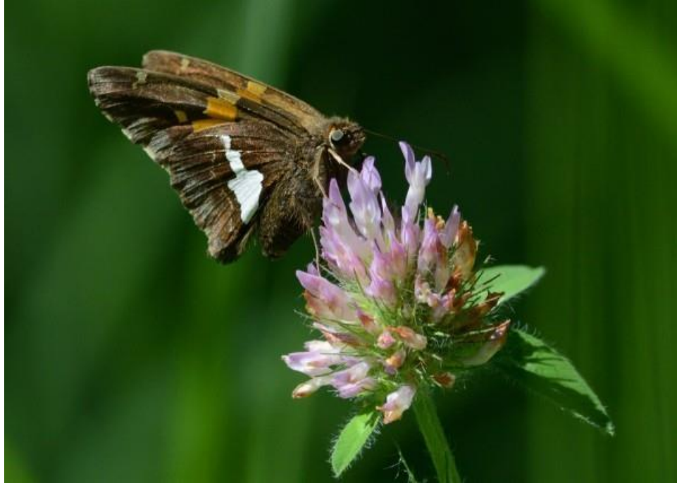
A Silver-spotted Skipper nectaring on Red Clover near Lac du Bonnet, 9 July 2018.