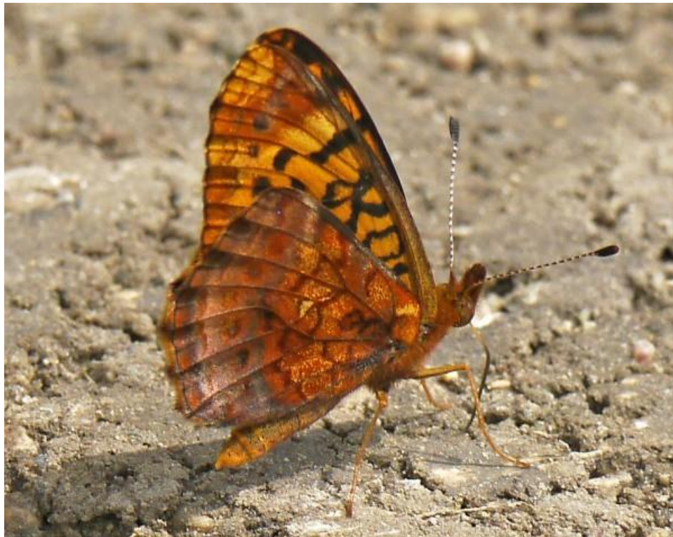
This Meadow Fritillary, probing a dirt-road surface near Prawda for moisture and salt, 9 July 2016, is identifiable by its indistinct hindwing pattern and slightly angular forewing shape.