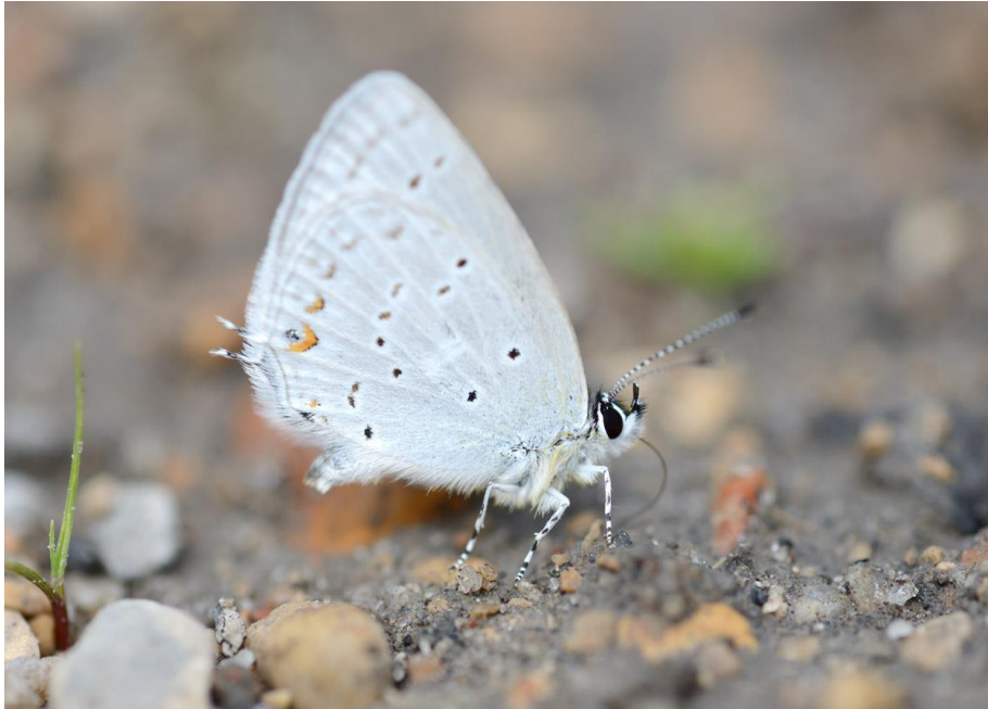
The best occasions in which to observe the delicate Western Tailed Blue are while it is puddling like this one at Sandridge Wildlife Management Area, 8 June 2020.