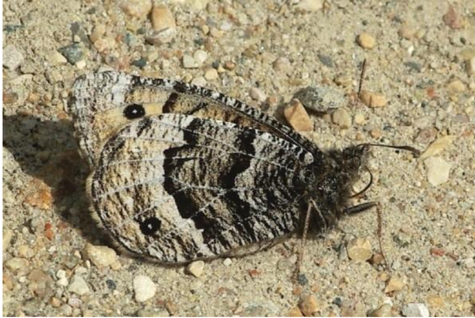
Alberta Arctic at Birds Hill Provincial Park, 12 May 2015.