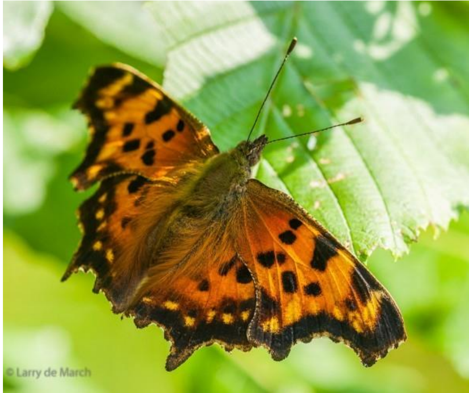
The shape of the wings identifies this butterfly as a comma; the dorsal pattern and colours identify it as a Green Comma. Whiteshell Provincial Park, 18 May 2016.