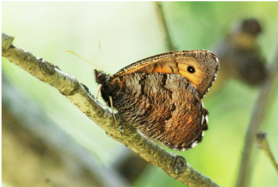
Macoun's Arctic at Mars Sand Hills, 10th June, 2016.