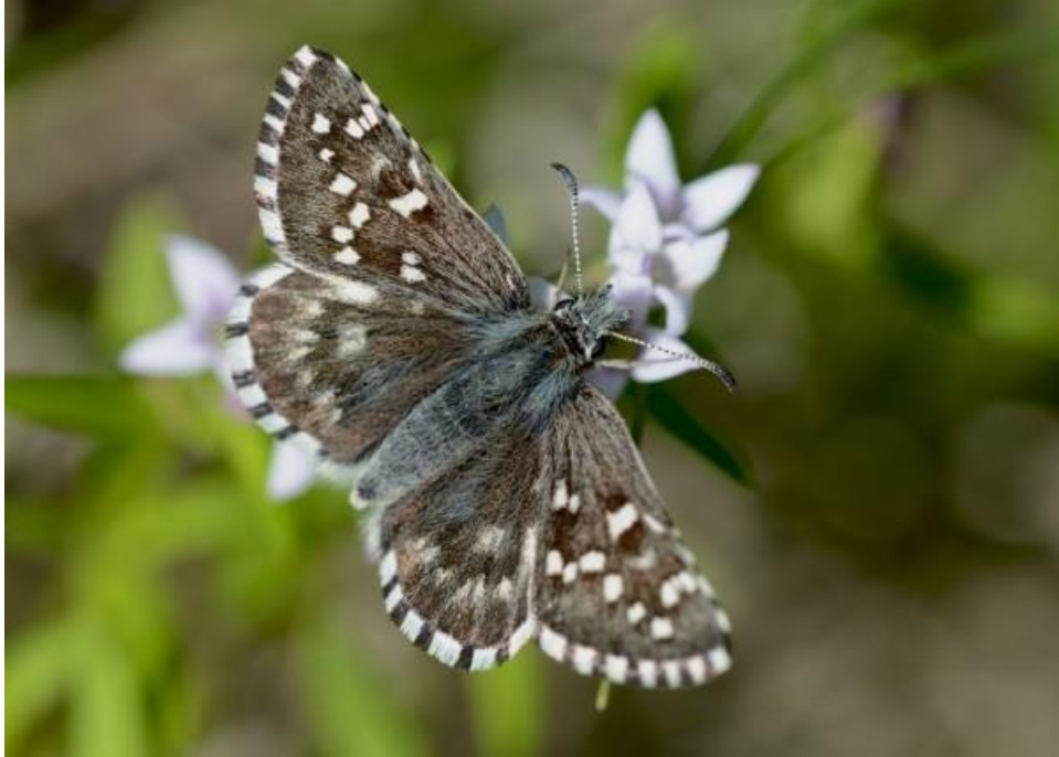
Northern Grizzled Skipper on Long-leaved Bluets (Houstonia longifolia), Nopiming Provincial Park, 4 June 2018.