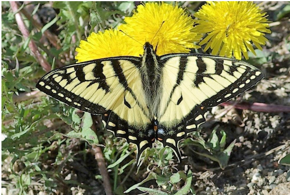
Canadian Tiger Swallowtail nectaring on early dandelions, Reed Lake, Grass River Provincial Park, 3 June 2013.

The Canadian Tiger Swallowtail is one of the largest North American butterflies, though smaller than its close relative the Eastern Tiger Swallowtail. It has black-striped yellow wings and is our commonest swallowtail, often gathering in large numbers at rain puddles on gravel roads in forest regions. Elsewhere, such as in gardens and parks, its large size, yellow coloration, and distinctive flight pattern of flap, flap, glide make it easy to identify. The Pipevine Swallowtail and Giant Swallowtail are two southern species that have previously occurred as rare vagrants in southeast Manitoba.