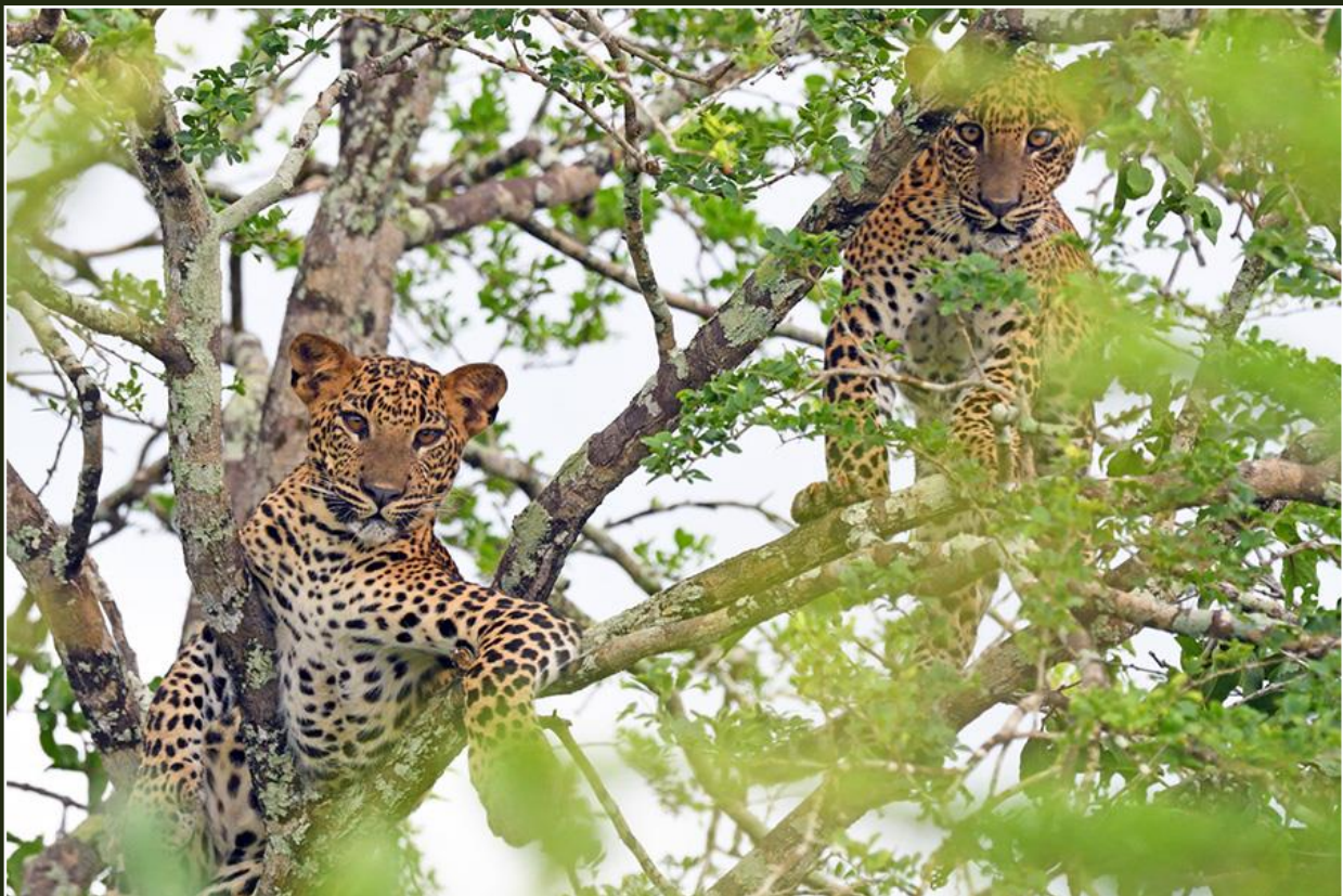
Leopards

Although the relatively open nature of the terrain accounts in part for Ranthambore's high rate of Tiger sightings, it is the reserve's skilled team of mahouts (elephant handlers) and local guides that has made it one of the foremost parks for seeing this elusive predator. In addition to Tigers and their favourite prey species, we may also come upon Indian Muntjac (Common Barking Deer), Chinkara (Indian Gazelle), Nilgai, Jungle Cat, Golden Jackal, Common Palm Civet, Striped Hyena and if we are extremely fortunate, Leopard and Sloth Bear. The interesting mixture of deciduous woodland and chauras (small wetlands) on the valley floors support good numbers of birds, with arguably the most spectacular of all being the resplendent Indian Peafowl, which is both gaudy and noisy!