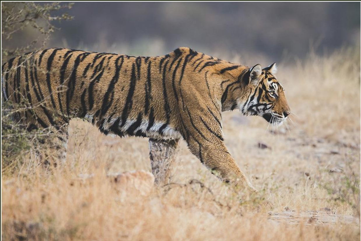
Tiger