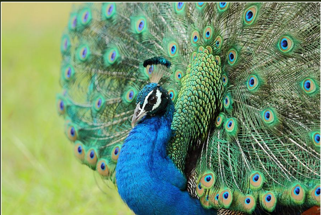
Indian Peafowl

If we are lucky we may also encounter Dhole (also known as Indian Wild Dog), the sought-after Sloth Bear or the much more frequently encountered Jungle Cat. Leopard, although normally elusive, do occur and we will be sure to keep an eye out for this stunning feline. Indian Fox and Golden Jackal are amongst the other special mammals we hope to encounter; while Bandhavgarh is also home to small numbers of Chausingha (Four-horned Antelope). Hanuman Langur should provide for some amusing encounters and we will be sure to listen out for their “alarm calls”, which may signal the presence of a predator!