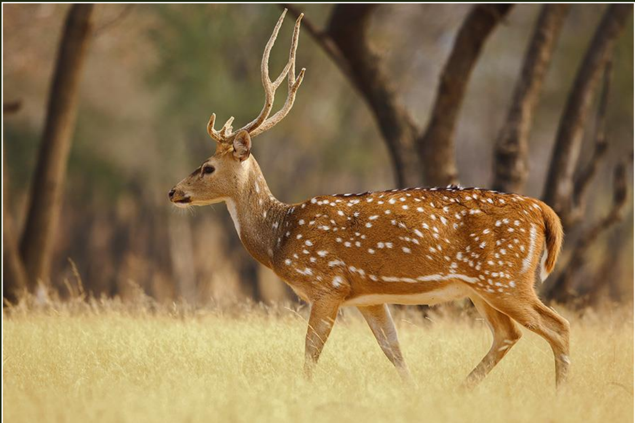
Chital (Spotted Deer)